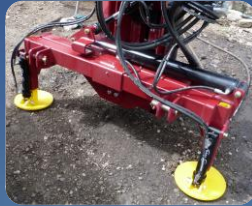
Contractor 600mm Side Hydraulic Legs

Optional 200mm - 600mm sliding side shift. Allows the feet to stay still and eliminates sideways force trying to move the tractor sideways. Essential when a rock spike is used.