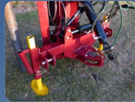
Superstriker 300mm Side

Optional Hydraulic Spike Turner - Moves the spike around into position hydraulically. Great safety feature by keeping operator away from monkey at all times. Allows for much faster operation in many ways.