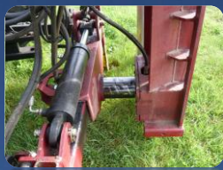
Contractor End Shift

W ith a reputation of being strong and long lasting, the Taege range of post drivers is built with you, the end user, in mind so that you get more bang for your buck. The things to look for in a post driver are: safety, strength, durability, ease and speed of use, and of course great value for money. There's no need to look any further than a Taege. With prices ranging from $6857 + GST to $40,000, there are plenty of options to choose from to suit your requirements.