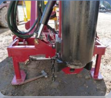
Farmer Sliding Side